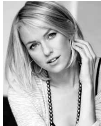
Actress - Naomi Watts Chateau Marmont, West Hollywood The Bowery Hotel, New York