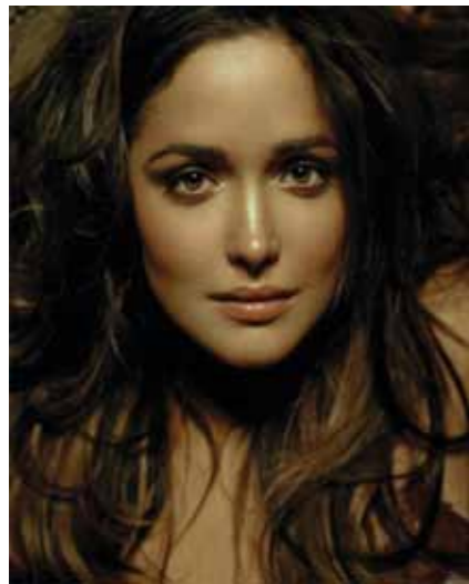
Actress - Rose Byrne L'Hermitage Beverly Hills The Prince