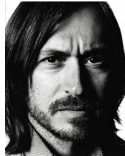
Designer - Marc Newson The Ritz Carlton, Tokyo Hotel Grand Bretagne Grand Hotel et de Milan Cowley Manor, England The Peninsula, Hong Kong